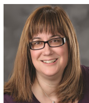
LORI e-commerce & IT