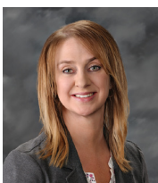
CLAIR receptionist cashier