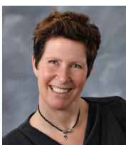
TROY community market/ product advisor