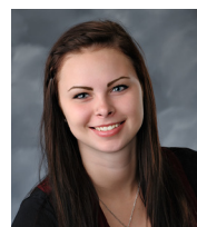
NICOLE e-commerce assistant